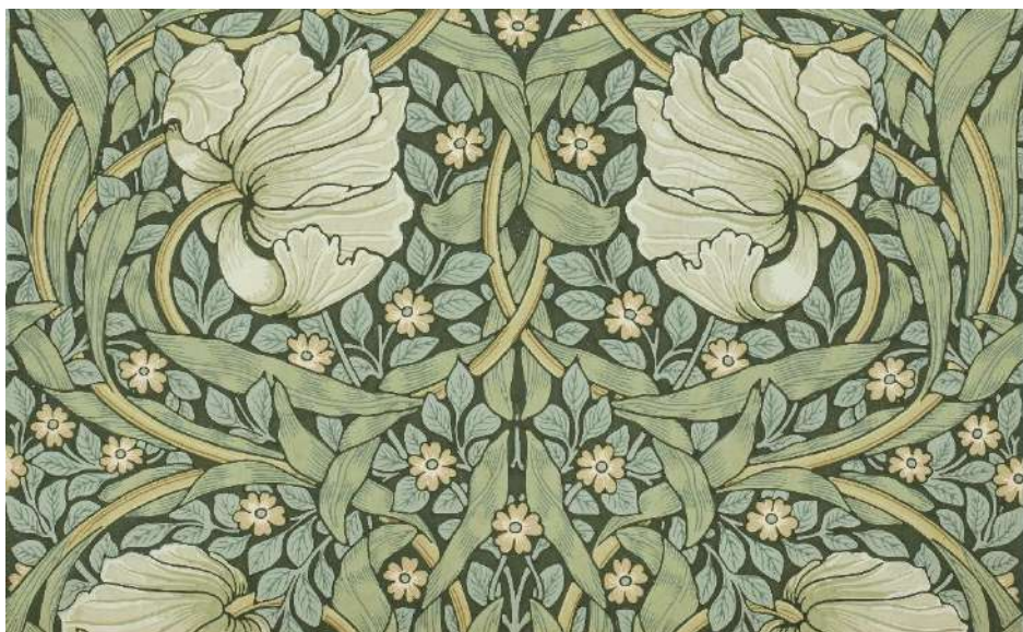
William Morris (designer), Jeffrey & Co. (manufacturer), The Pimpernel , around 1876. Paris, Museum of Decorative Arts

Exhibition at La Piscine museum in Roubaix from 8 October 2022 to 8 January 2023